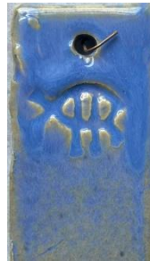
Blue Sky (gloss)

Note: There are many elements that affect the final color of a glaze: the makeup of the glaze itself, the firing temperature, atmosphere, speed, and the type of clay. Due to the variables of the glazing and firing process exact color matches cannot be guaranteed. Colors are approximate.