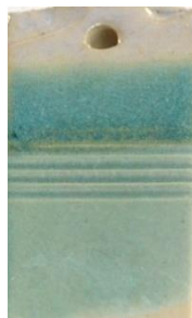
Sea Foam (matte)